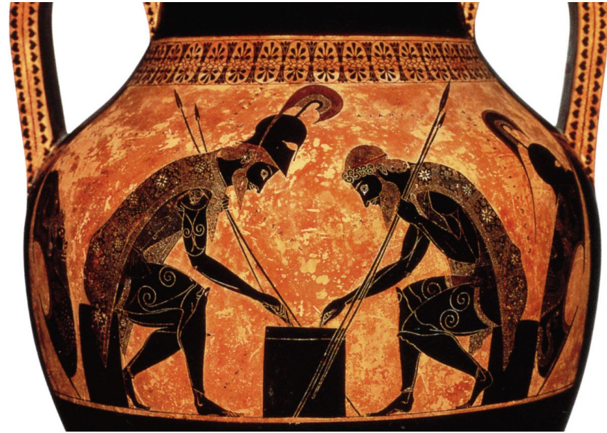
Achilles and Ajax playing dice before a battle